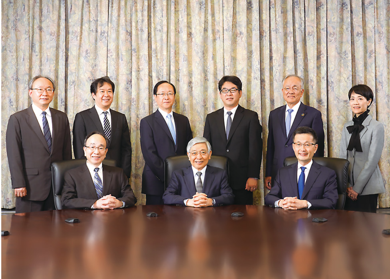
Standing from left to right: NOGUCHI Asahi, ADACHI Seiji, SUZUKI Hitoshi, KATAOKA Goushi, NAKAMURA Toyoaki, and NAKAGAWA Junko Seated from left to right: AMAMIYA Masayoshi, KURODA Haruhiko, and WAKATABE Masazumi